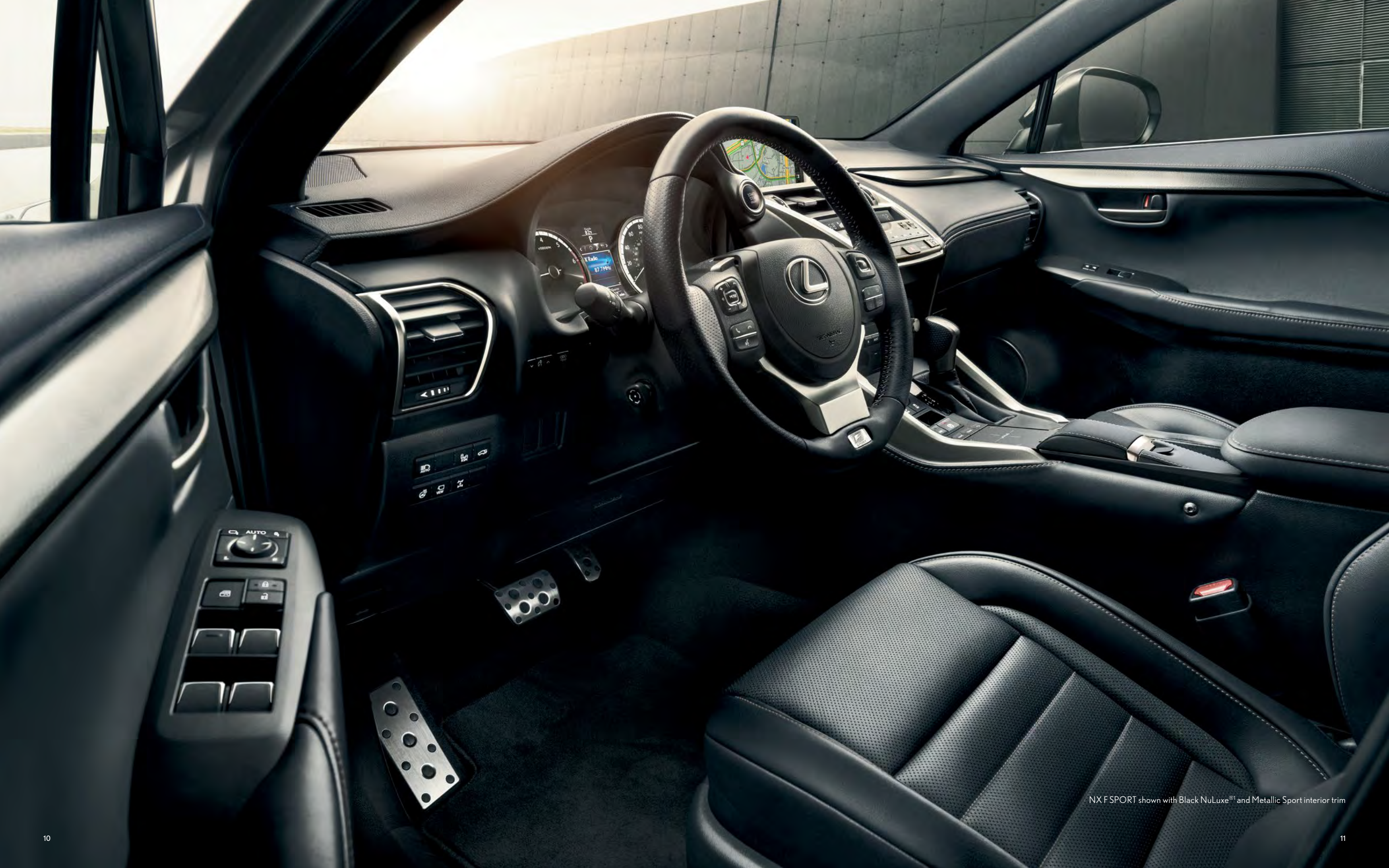
NX F SPORT shown with Black NuLuxe ® and Metallic Sport interior trim