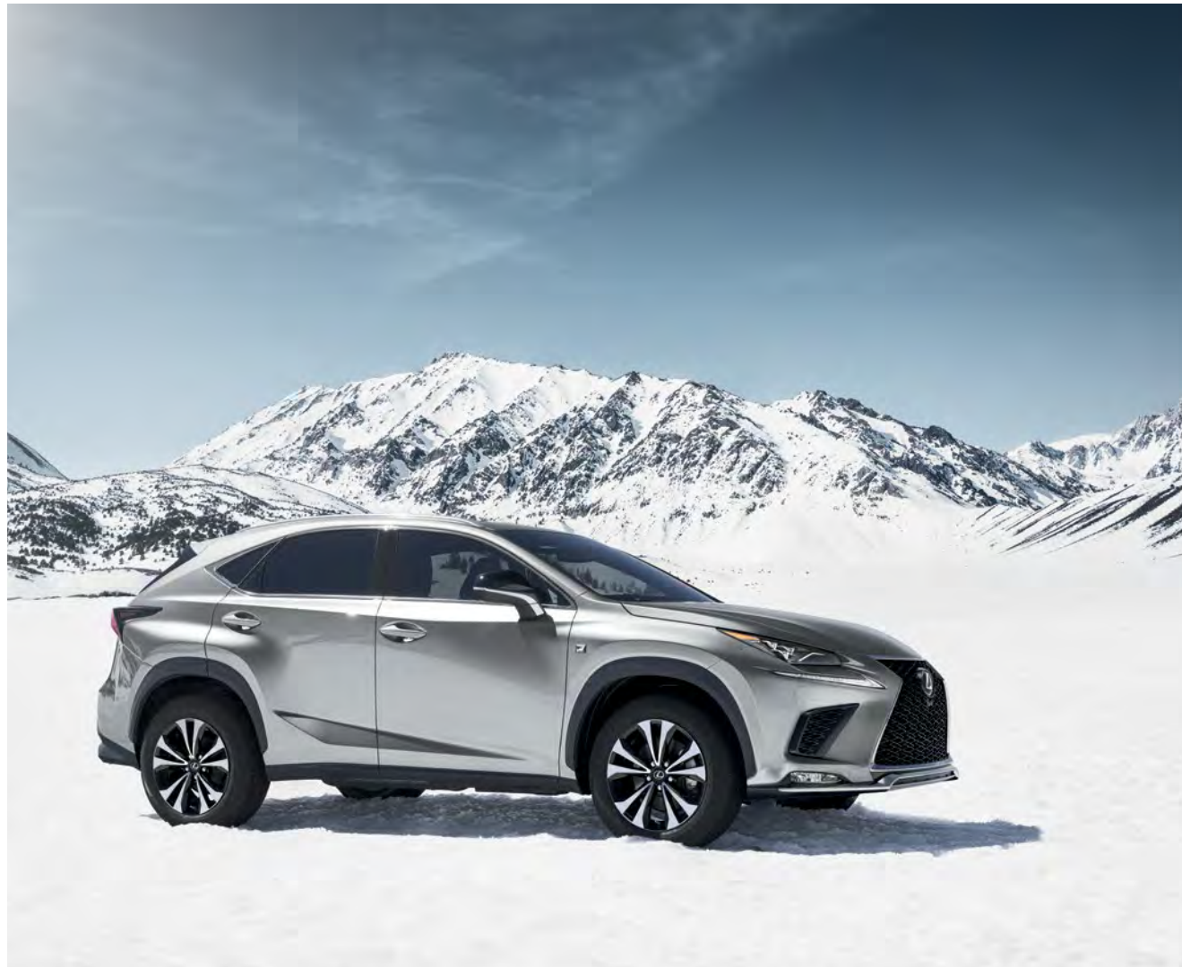
NX F SPORT shown in Atomic Silver

The NX F SPORT doesn't just look the part—it feels it. From its aggressive exterior styling to deeply bolstered front sport seats that hug you through the turns, this luxury crossover brings exhilaration to every drive. Exclusive Circuit Red NuLuxe ®1 and Arctic White NuLuxe interior trims boldly reflect its performance roots. And impeccable contrast stitching completes the experience of pure invigoration for all the senses.