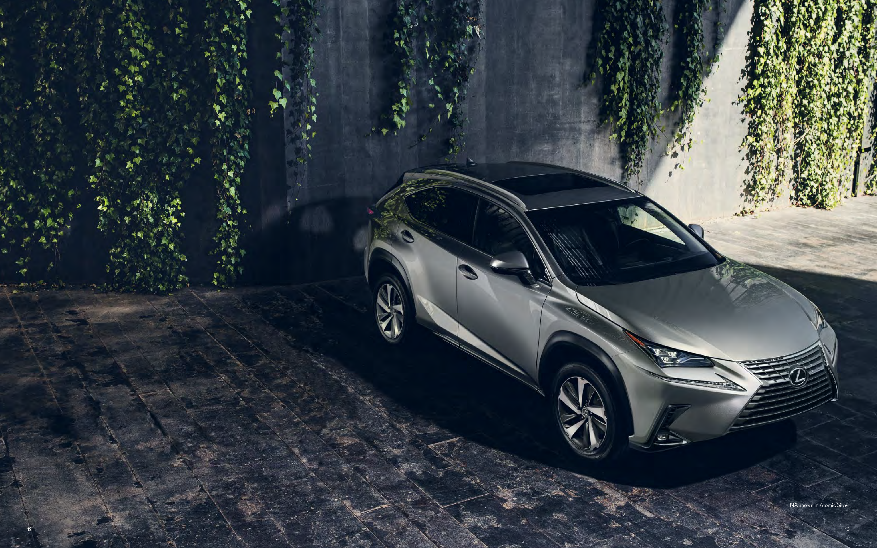
NX shown in Atomic Silver.