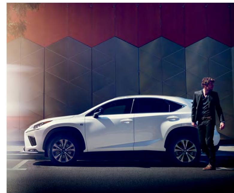
NX F SPORT shown in Ultra White 10

Experience LED illumination that catches eyes. And thoughtful details that open them.