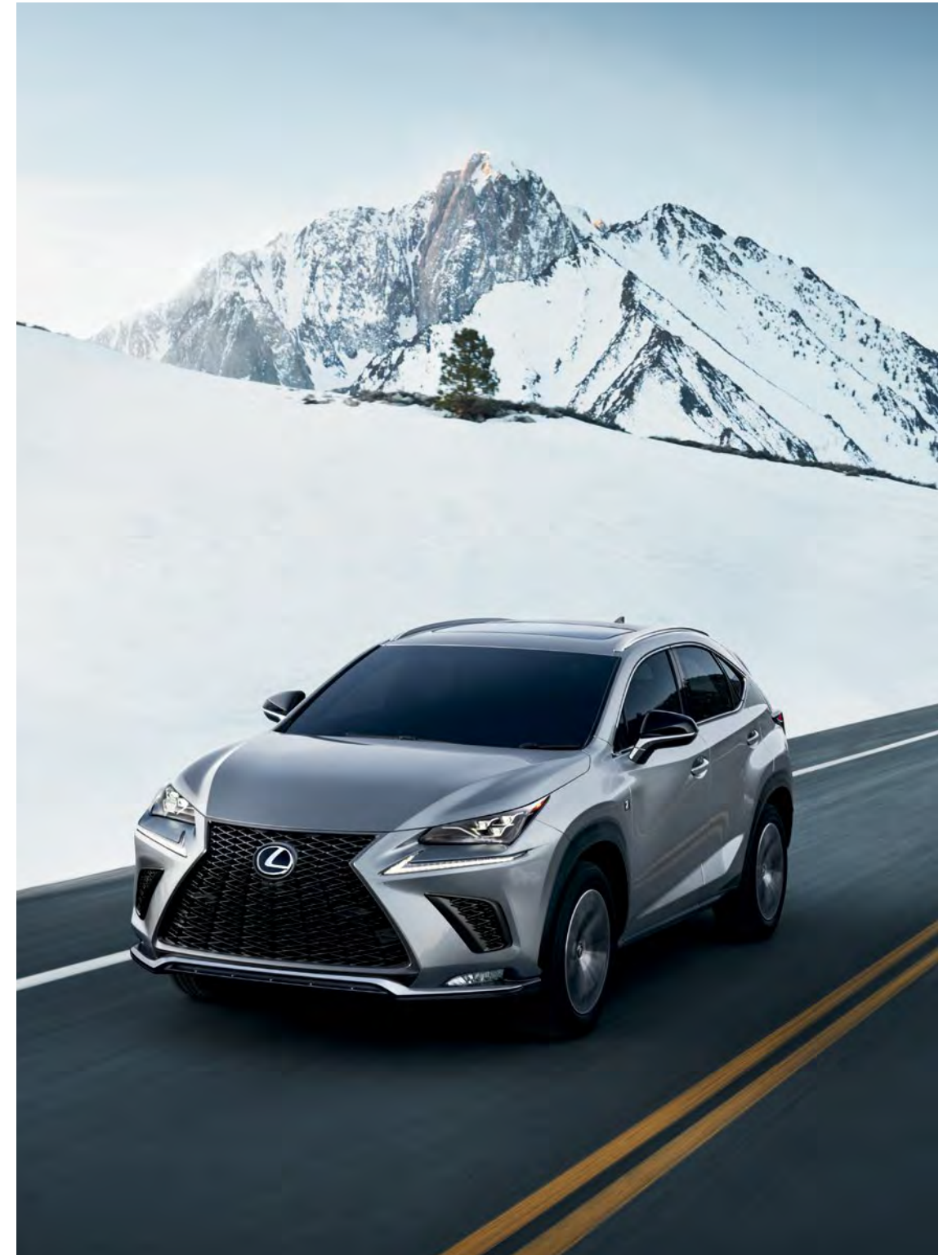
NX F SPORT shown in Atomic Silver