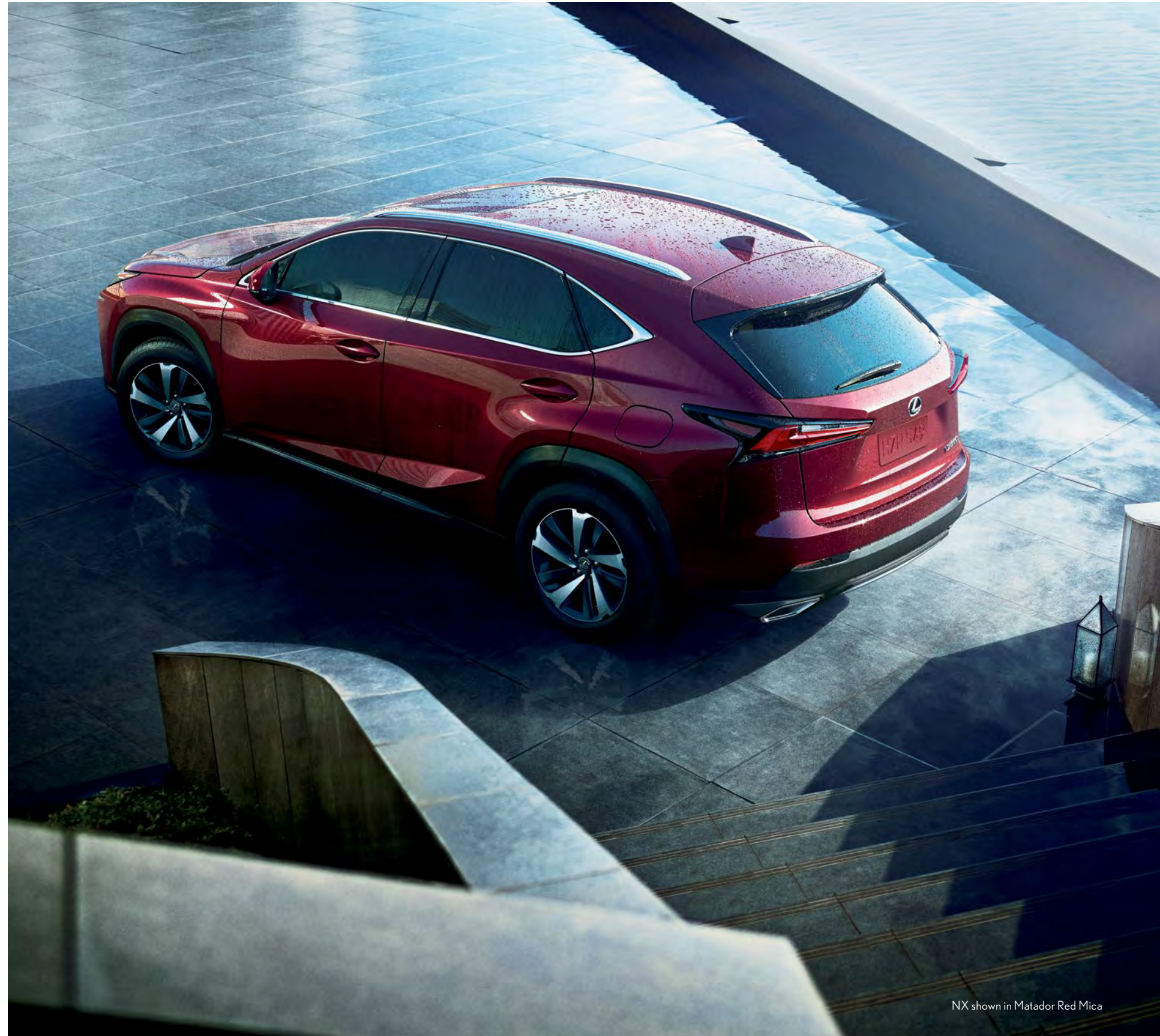
NX shown in Matador Red Mica

Split-five-spoke alloy wheels with Gloss Black and machined finish and all-season tires NX F SPORT