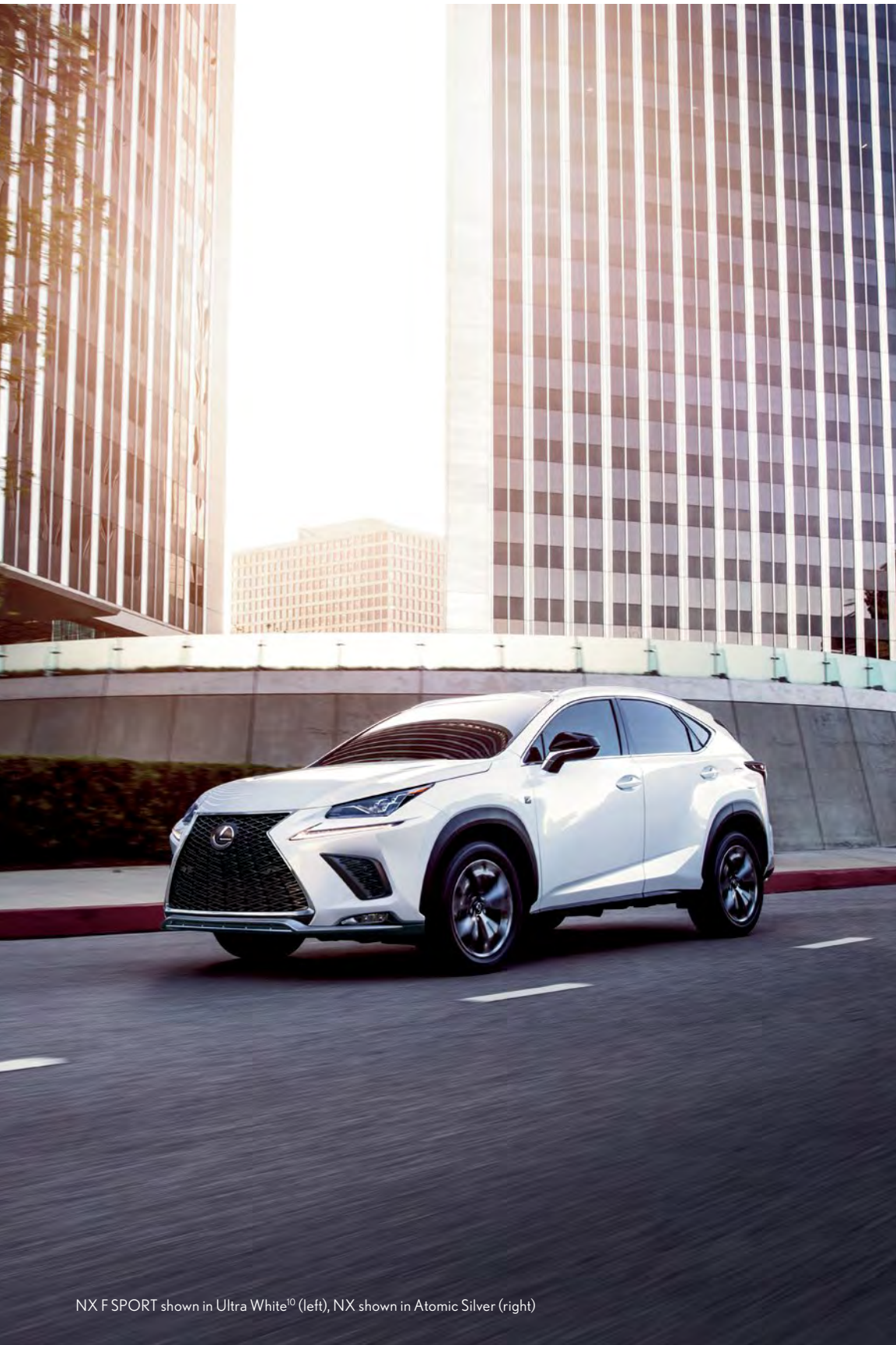
NX F SPORT shown in Ultra White 10 (left), NX shown in Atomic Silver (right)