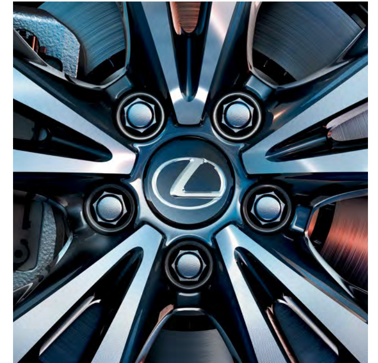
NX F SPORT shown in Ultra White 10

With class-leading standard Lexus Safety System+ 2.0, 4,5 including features such as advanced pedestrian detection technology, 11 Lane Departure Alert with Steering Assist, 12 and Lane Tracing Assist, 13 the NX changes the conversation about what a luxury crossover can be.